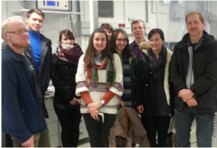
Participants from the SIMS short course during a visit to the Super SIMS instrument in Dresden.